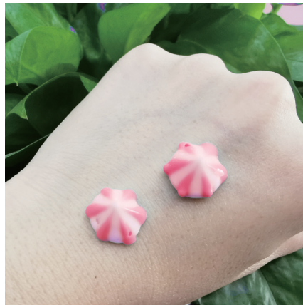
挤出花型 Shape Extruded