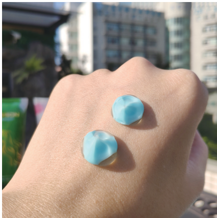
挤出花型 Shape Extruded