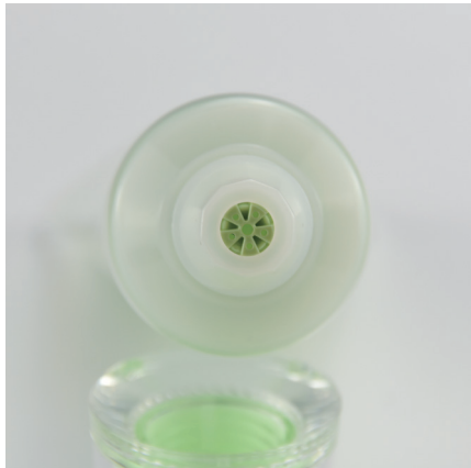
子母管口 The Orifice of Dual Chamber Tube

內管可裝容量: 20-50ml / 外管可裝容量: 20-50ml / 總容量: 40-100ml Capacity:40-100ml (inner:20-50ml/outer:20-50ml)