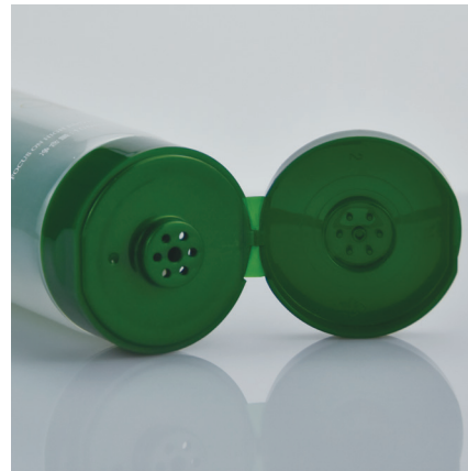
子母管口 The Orifice of Dual Chamber Tube

內管可裝容量: 20-50ml / 外管可裝容量: 20-50ml / 總容量: 40-100ml Capacity: 40-100ml (inner: 20-50ml/outer: 20-50ml)