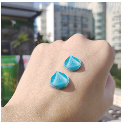
挤出花型 Shape Extruded