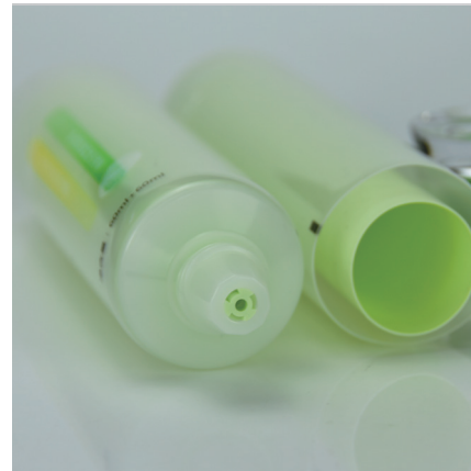
子母管口 The Orifice of Dual Chamber Tube

內管可裝容量: 30-60ml / 外管可裝容量: 30-60ml / 總容量: 60-120ml Capacity:60-120ml (inner:30-60ml/outer:30-60ml)