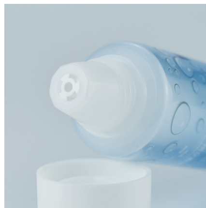
子母管口 The Orifice of Dual Chamber Tube

內管可裝容量: 15-20ml / 外管可裝容量: 15-20ml / 總容量: 30-40ml Capacity: 30-40ml (inner: 15-20ml/outer: 15-20ml)