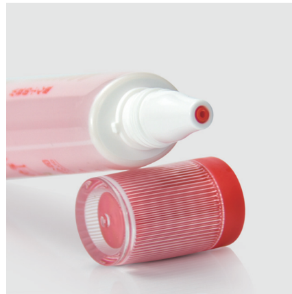
子母管口 The Orifice of Dual Chamber Tube

內管可裝容量: 10-15ml / 外管可裝容量: 10-15ml / 總容量: 20-30ml Capacity: 20-30ml (inner: 10-15ml/outer: 10-15ml)