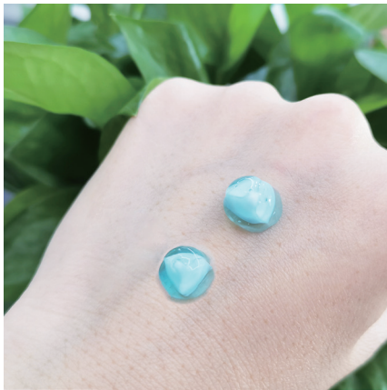
挤出花型 Shape Extruded