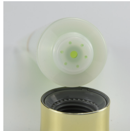
子母管口 The Orifice of Dual Chamber Tube

內管可裝容量: 20-50ml / 外管可裝容量: 20-50ml / 總容量: 40-100ml Capacity:40-100ml (inner:20-50ml/outer:20-50ml)