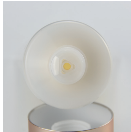
子母管口 The Orifice of Dual Chamber Tube

內管可装容量: 50-100ml / 外管可装容量: 50-100ml / 总容量: 100-200ml Capacity: 100-200ml (inner: 50-100ml/outer: 50-100ml)