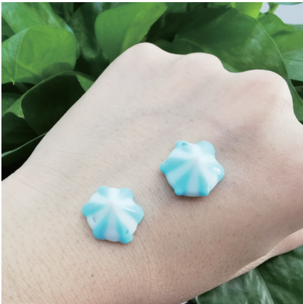
挤出花型 Shape Extruded