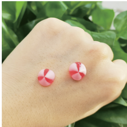
挤出花型 Shape Extruded