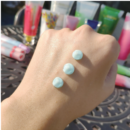
挤出花型 Shape Extruded