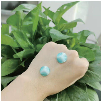
挤出花型 Shape Extruded