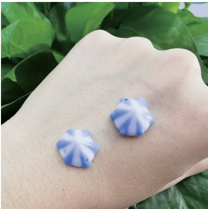
挤出花型 Shape Extruded