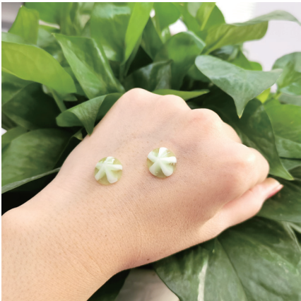
挤出花型 Shape Extruded