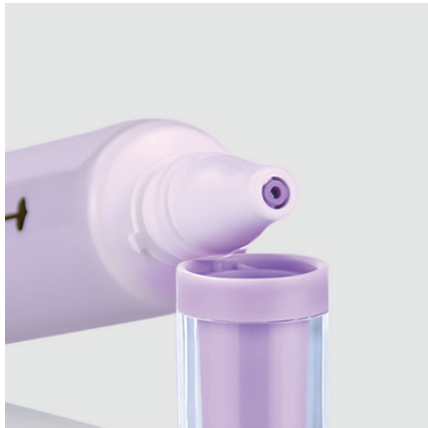
子母管口 The Orifice of Dual Chamber Tube

內管可装容量: 10-15ml / 外管可装容量: 10-15ml / 总容量: 20-30ml Capacity:20-30ml (inner:10-15ml/outer:10-15ml)